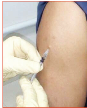
Figure 2 Formation of bleb (papule) after ID injection