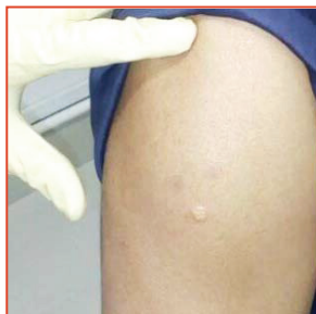
Figure 3 Blanching and 'Peau de Orange' appearance