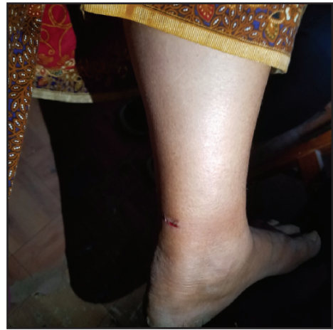
Figure 2. A dog bite case visiting Sukraraj Tropical and Infectious Disease Hospital for Rabies PEP