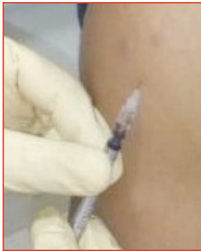
Figure 1 Insertion of needle for ID injection

As per the WHO approved regimen, 0.1 ml of reconstituted vaccine is given per ID site and on two such ID sites per visit on days 0, 3, 7 .