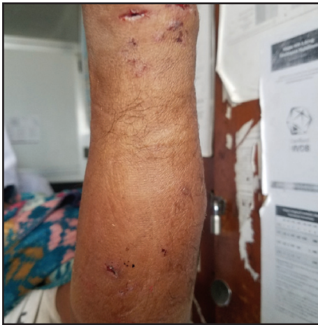
Figure 1. A dog bite case reported from Sukraraj Tropical and Infectious Disease Hospital

Rabies is transmitted through direct contact between the virus (e.g. in contaminated saliva), and mucous membranes or wounds. Human infection most frequently occurs following a transdermal bite or scratch from an infected animal. Very rarely, rabies has been contracted by inhalation of virus-containing aerosol (e.g., in caves inhabited by bats). Human-human transmission has never been confirmed, with the exception of organ transplants from rabid patients.